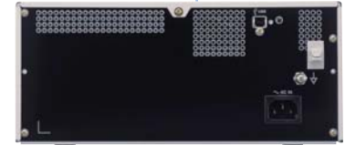
UP-D55MD Back Panel