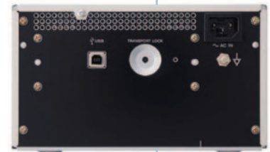
UP-D23MD Back Panel