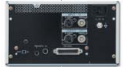
UP-20 Back Panel