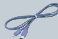
VMC-IL4615B/IL4635B i.LINK cable (6-pin to 4-pin)