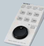
SVRM-100A Remote Control Unit