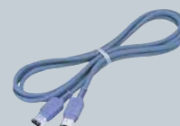
VMC-IL6615B/IL6635B i.LINK cable (6-pin to 6-pin)