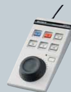
DSRM-10 Remote Control Unit